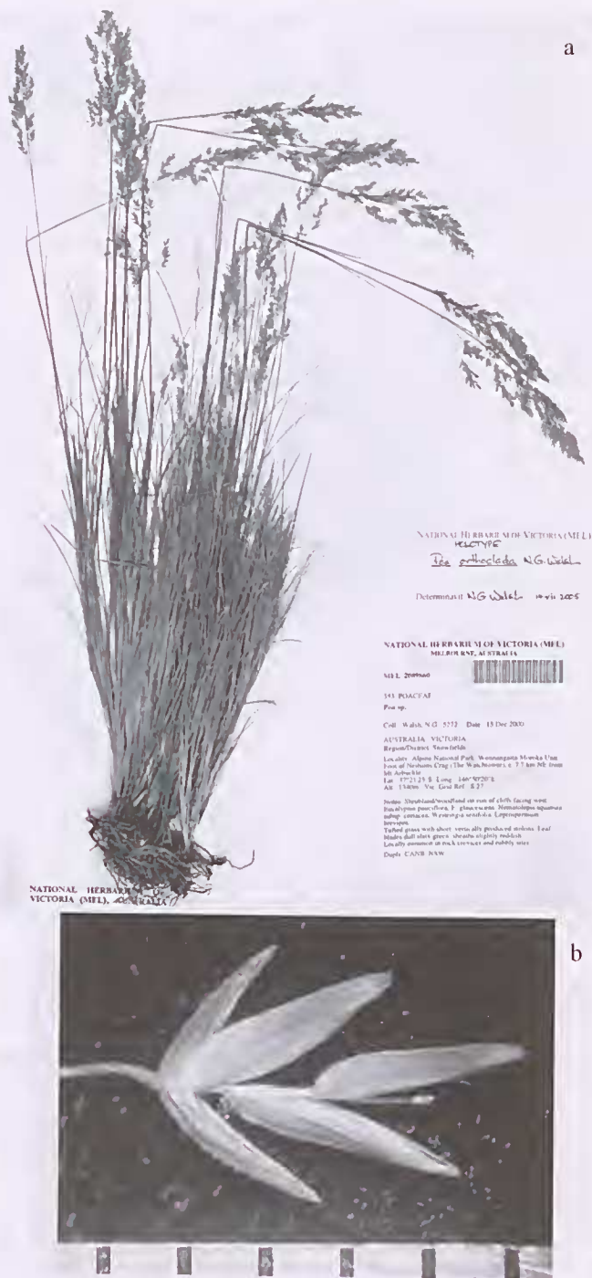
Figure 2. a. Poa orthoclada holotype; b. Poa orthoclada spikelet (from holotype). Scale interval 1 mm.